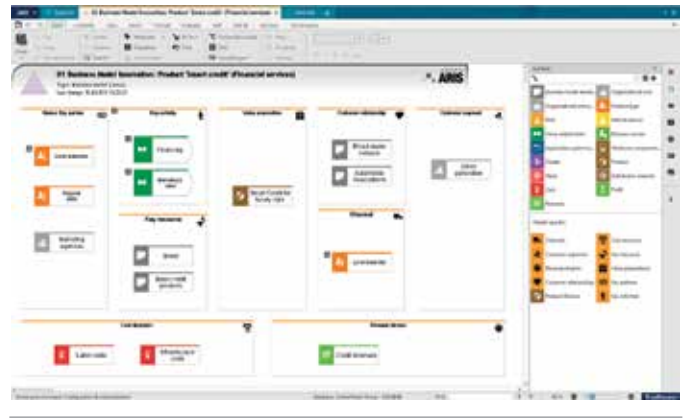
Business Model Canvas (by A. Osterwalder) - a strategic management template for developing new or documenting existing business models.